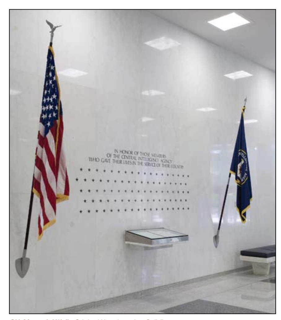
CIA Memorial Wall Original Headquarters Building