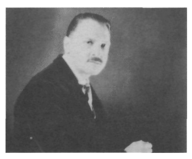
Somerset Maugham-MI6 special agent to Kerensky.