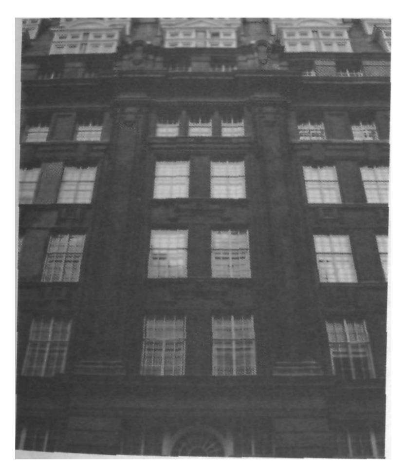
MI6 Headquarters London.