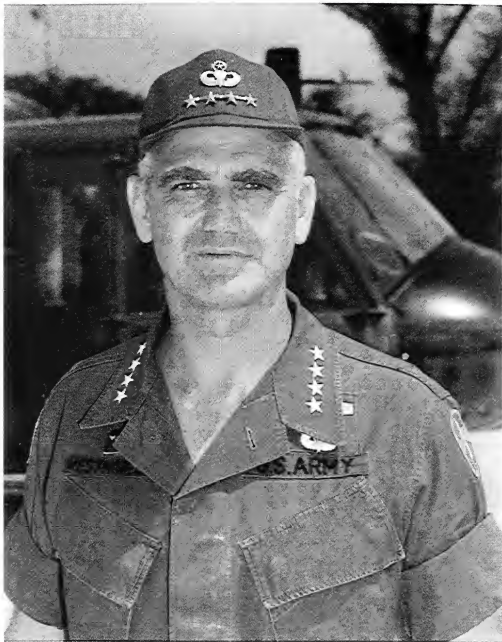
Gen. William Westmoreland

Gen. W. C. Westmoreland, November 1967: Infiltration will slow; the Communist infrastructure will be cut up and near collapse; the Vietnamese Government will prove its stability, and the Vietnamese army will show that it can handle the Vietcong; United States units can begin to phase down. 90