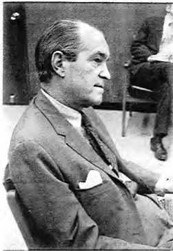
DCI Richard Helms