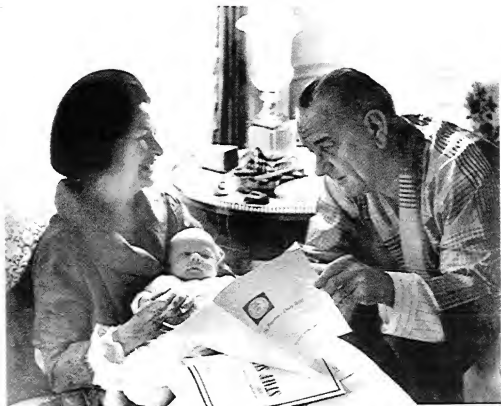
President Johnson—with Mrs. Johnson and their infant grandchild—reviewing the daily intelligence report.