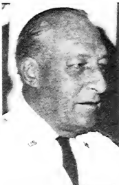
Gen. Paul Harkins

In these, McCone was consistently more pessimistic about likely developments than were virtually all of Washington's other senior officers, and certainly much more pessimistic than he had himself been, early in 1963, when he had decried the gloomy outlook of NIE 53-63 and demanded its revision. Soon after the Vietnamese generals' coup on 1 November, the DCI had registered his concern at a 20 November Honolulu policy conference, where he found MACV General Harkins's assessment of the Vietnam situation too rosy and returned to CIA "more discouraged about South Vietnam than ever in the past." 62 McCone was still troubled four days later when he told President Johnson that he did not agree with Ambassador Lodge's postcoup enthusiasms: "I concluded by stating that we could not at this point or time give a particularly optimistic appraisal of the future." 63