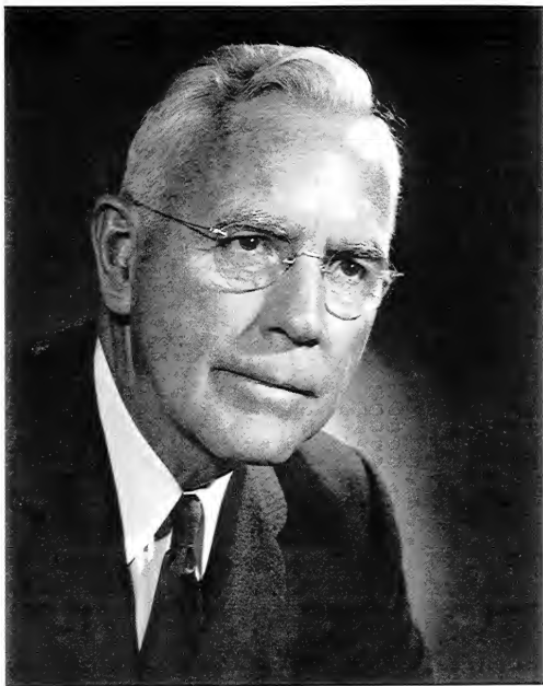
DCI John McCone